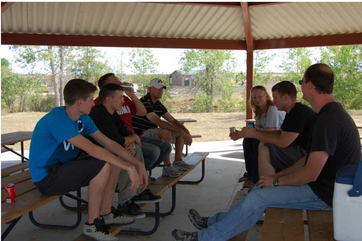
Detachment team members taking a well deserved rest after providing the set up, grilling, and clean up